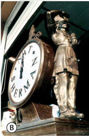
A. Sesame Street characters B. 42nd and 5th Ave, NY C. Atlantic City icon

EDON's ability to produce shapes and sizes of complex configurations allows architects and designers solutions for hotels, casinos and theme parks.