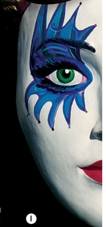
D. Entertainment center, Guam E. 20' Busch Stadium sign, St. Louis F. Symphony House canopy, Philadelphia, PA G. Trump Taj Mahal main entrance sign, AC H. Merv Griffin logo sculpture I. Harrah's, Kansas City.

EDON is a well-respected provider of corporate logos and unique signage