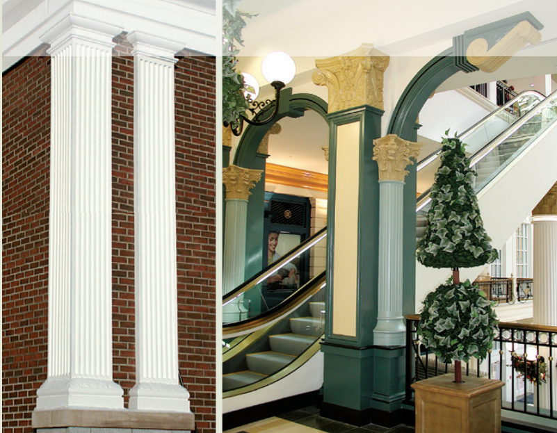
NYCM Insurance, Edmeston, NY