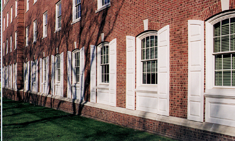
Johnson & Johnson Corporate Offices, NJ