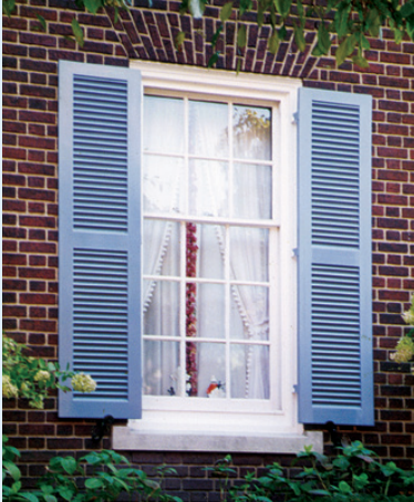
Residential application, Pittsburgh, PA