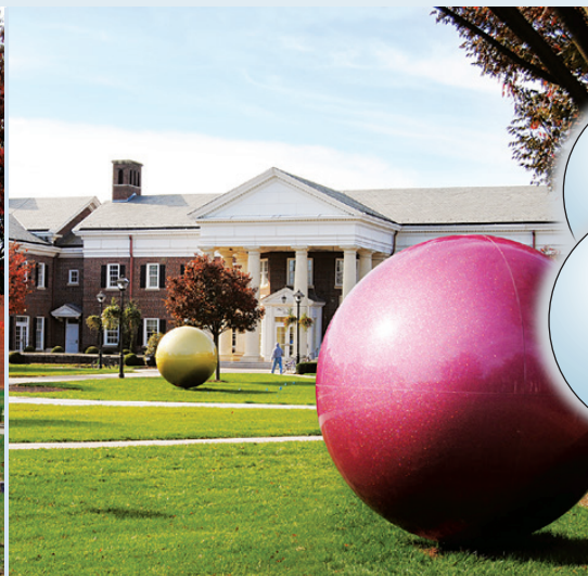
(8' Spheres, Designer Willie Cole), College of New Jersey, NJ