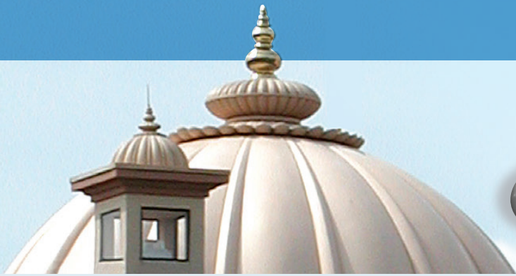
Anoopam Mission, Coplay, PA